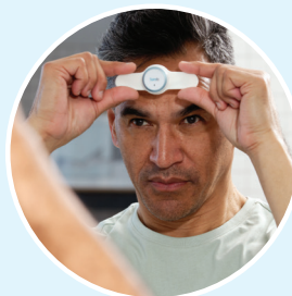
Quick and simple application. No wires.

The Somfit range was designed for easy application and use by the patient at home. They can be setup with a few simple steps, while enabling the collection of high-quality signals providing medical grade data to aid in the clinician's diagnostic capabilities.