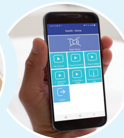
Easy to use APP.