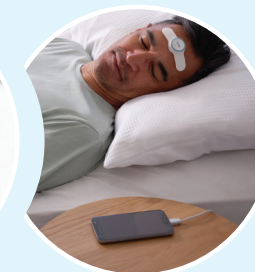
Light & comfortable.