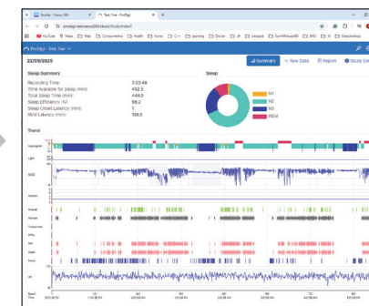
ProDigi PSG Sleep Review