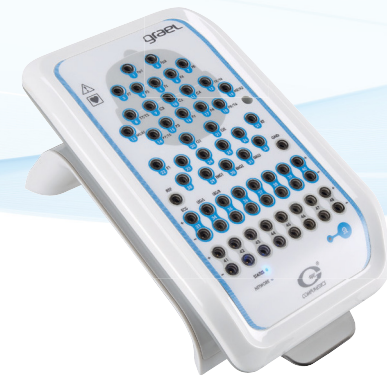
grael 4K PSG: EEG 60 CH PSG/EEG

Grael® for dual-platform PSG and EEG, Grael® EEG or LT for dedicated EEG studies or Grael® PSG for AASM compliant Sleep studies.