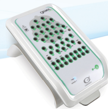
grael EEG 44 CH EEG

An even more powerful evolution of the Grael® EEG amplifier built for EEG studies for clinical and research applications including routine, LTM, ICU and Evoked potentials.