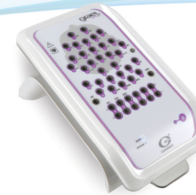
grael LT 38 CH EEG

Industry-leading value amplifier with research-grade technology. A powerful EEG amplifier aimed at clinical EEG studies.