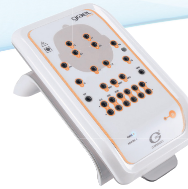
grael PSG 29 CH PSG

Based on the flagship Grael® amplifier, the Grael® PSG has a channel subset dedicated for Sleep studies. A true-HD PSG amplifier with channels as specified for the gold standard AASM Type 1 studies.