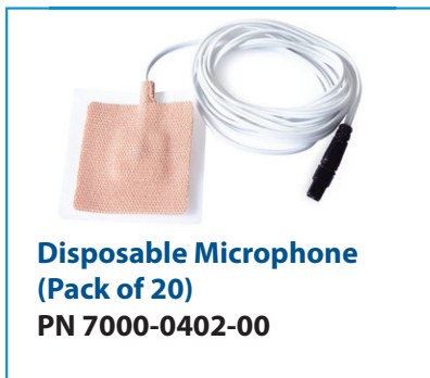
Disposable Microphone (Pack of 20) PN 7000-0402-00