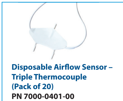
Disposable Airflow Sensor - Triple Thermocouple (Pack of 20) PN 7000-0401-00

Graef - PN 7028-0015-01 Somté PSG - PN 7012-0021-01