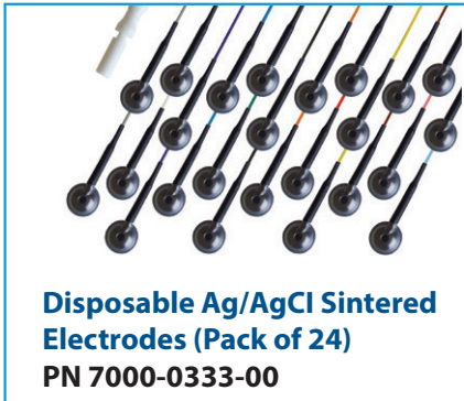
Disposable Ag/AgCl Sintered Electrodes (Pack of 24) PN 7000-0333-00

Quality and economical range of disposable electrodes for cross infection control.