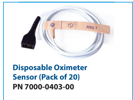
Disposable Oximeter Sensor (Pack of 20) PN 7000-0403-00