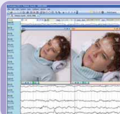
Dual Video Floating Window