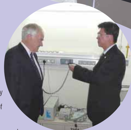
Above - From left to right:

This was indeed an experience to be part of such a delegation, as the opportunities that were presented to individual delegates would be difficult to achieve without the help and support from organizations such as the Victoria State Government and the people who organized such events. Three potential business partners were identified during this trip. Compumedics looks forward to a successful future within the Indian region.